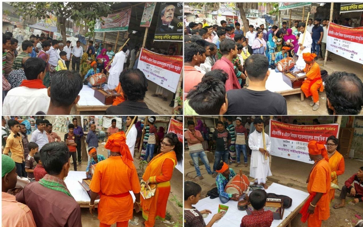
Street Drama, Jatrabari

for implementing outreach activities for hotel and residence. Because hotels are involve with illegal business. On the other hand residence based sex workers are usually live in the mainstream people. Both hotel and residence maintain confidentiality. For this in the night they do not allow easy access of NGO staffs.