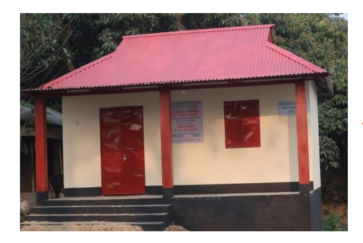
Jolormuk Abadepara Govt. Primary School